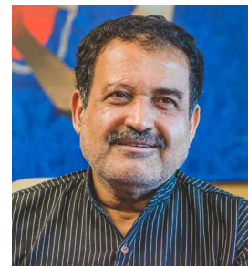
Mr TV Mohandas Pai Chairman, Manipal Global Education Services Private Limited and Past President, AIMA